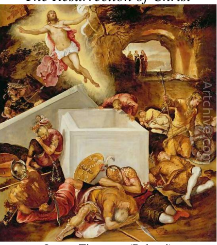
Jacopo Tintoretto (Robusti)