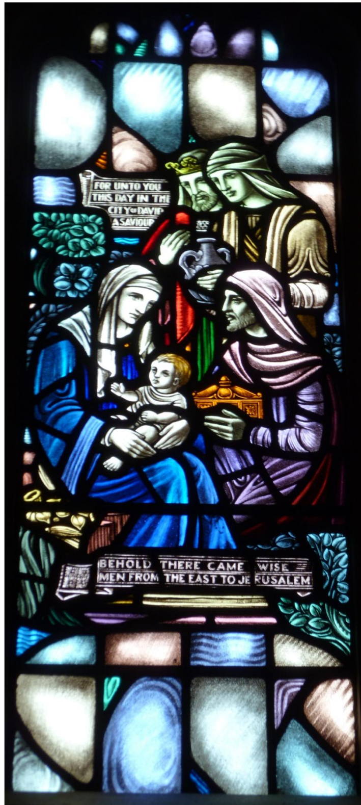
The Life of Christ Window