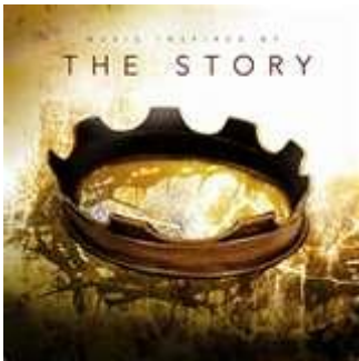
The Story – This Week – Chapter 1 “Creation: The Beginning of Life as We Know It”