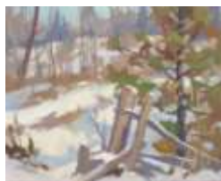
Roadside Near Markham, oil