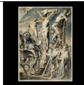
Peter Paul Rubens, the 'Coup de Lance', a drawing