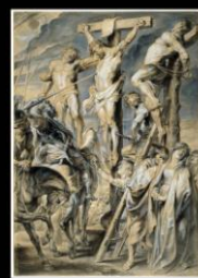
Peter Paul Rubens, the 'Coup de Lance', a drawing