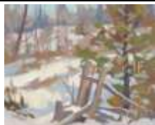
Roadside Near Markham, oil

Les Tibbles: A Lifetime of Landscape Continues to February 22