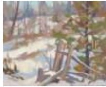
Roadside Near Markham, oil

Les Tibbles: A Lifetime of Landscape Continues to February 22