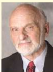
The Rev. Dr. Walter Brueggemann