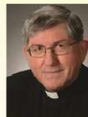
Archbishop Thomas Cardinal Collins

For more information or to register visit lesterrandall.com today!